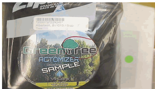
Package received -labeling COC