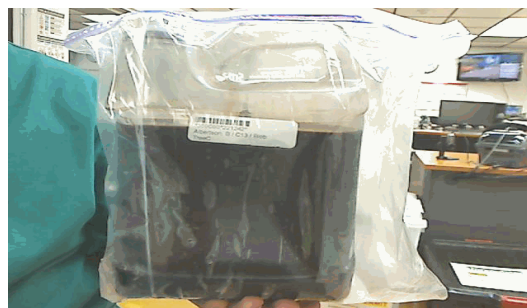
View of content