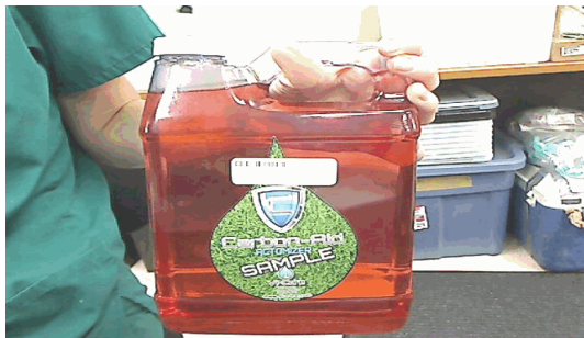
View of package #2