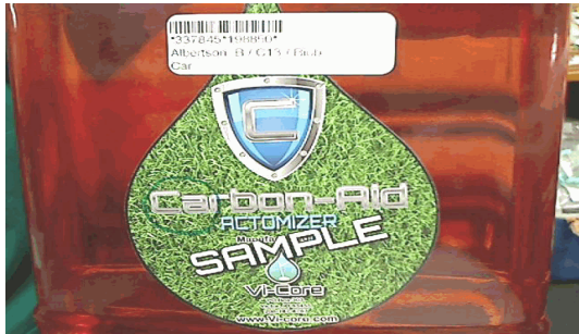
Package received -labeling COC